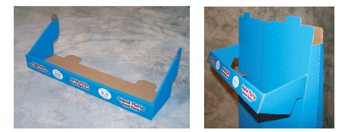
3. Finished Shelf Place finished shelf into main base using the tabs from the shelf and placing inserts into the base. A total of 10 shelves, (five per side).