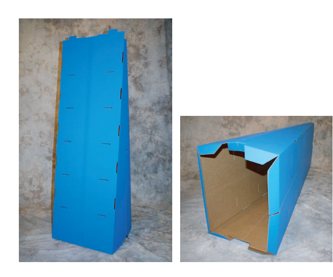
1. Main base Fold-in sides and fold in bottom tabs.