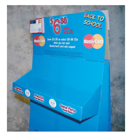
5. Place header on top of base for your finished display.